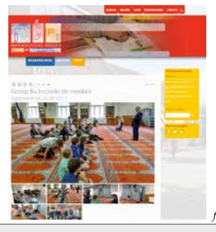
figure 10.2 figure 10.3