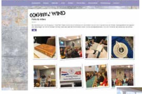
figure 12.1 figure 12.3